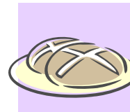
6. hot cross buns