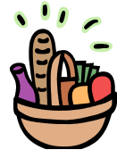
3. blessing basket